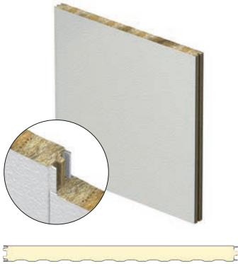
THERMALSAFE® SANTA FE PANEL